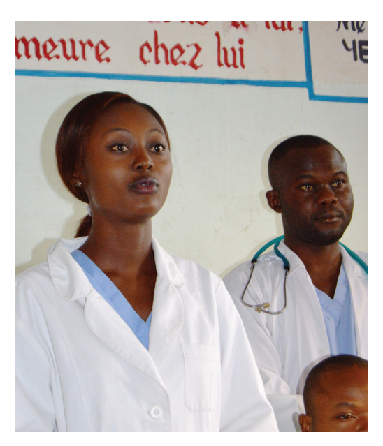
Medical intern presenting a case to her peers and supervisor

The condition of DRC's roads and UPC's limited financial resources created major challenges to implementing this strategy, particularly in transporting the interns and their supervising faculty to two of the three training sites. The University had been using a donated vehicle for this purpose. Due to heavy use and the poor condition of the roads, the vehicle suffered a serious accident and was beyond repair. The University was faced with the difficult problem of getting the students and preceptors to their assigned locations. This put in jeopardy the completion of the students' clinical training and subsequent graduation.