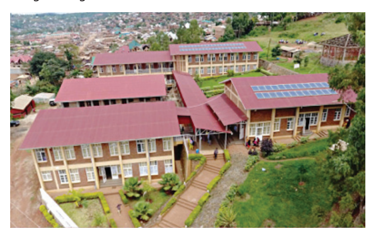
The School of Agronomy on the beautiful UEA campus in Bukavu

As a way of exploring potential partnership, Education Congo has offered an initial scholarship fund, and requested project proposals from UEA that Education Congo may support over the next 5 years. UEA leadership responded with four detailed proposals that focus on key issues facing the region and on preparing students to address them. These proposals include projects in medical practice, healing from psychological trauma, peace and reconciliation, and English language acquisition. Education Congo is currently evaluating these proposals and hopes to share in coming issues of Communiqué how you may participate with us in supporting these projects that are so critical to the Kivu region and to the Congo at large.