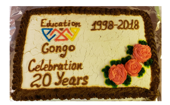
Education Congo celebrates 20 years of helping to build a stronger Congo through education.

I know that all these projects require money, and it can take time for their implementation. Many hands can together help us to move ahead. I am always impressed by what Education Congo members and caring American donors are doing for the Congolese people. Thanks again.