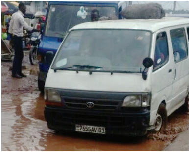
Logistics for transporting blood samples in Kinshasa can be challenging

Research and teaching are at the heart of any university. Hence building research capacity at the Congo Protestant University (UPC) is a key part of Education Congo's (EC) mission. Developing infectious disease research capacity at the University's Medical School began in collaboration with Johns Hopkins University. We have now received funding to extend the malaria research over several years to come.