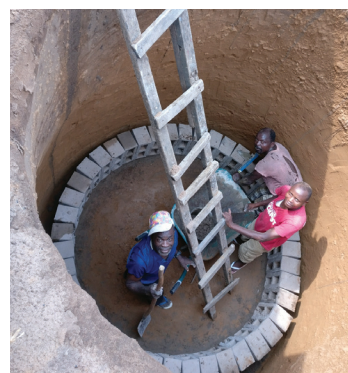
Rehab project - sewer system

Education Congo saw an opportunity to partner with Vanga Hospital and the U.S. Embassy in Kinshasa to rehabilitate the housing for these young physicians in-training. Together these